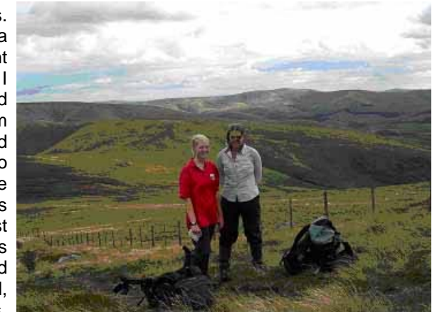
A breather on the last day of the Pennine Way.

realisation that a year's planning had paid off, and that we were hours from completing the trip of a lifetime. We took the rest of the day very steadily so that we could savour every moment. The scenery was the most fantastic yet; we were very high up and the weather was perfect. We arrived at the end of our journey the same as we started – side by side, with smiles on our faces and all of our equipment on our backs.