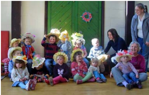
Above left: Easter bonnets were also on display at Youlgrave Playschool. Above right: Noah the donkey takes part in the Palm Sunday celebrations at All Saints Church.