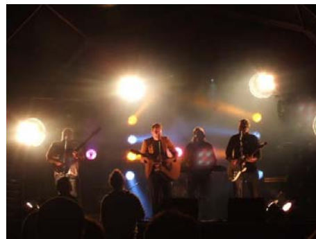
Corkstone – tipped for greatness.

A concert by Warslow Silver Band, with a guest supporting artiste, has been arranged to be held at the Youlgrave Methodist Church on Saturday 1 September at 7.30pm.