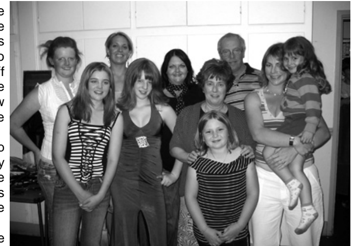
Youlgrave's very own budding models!