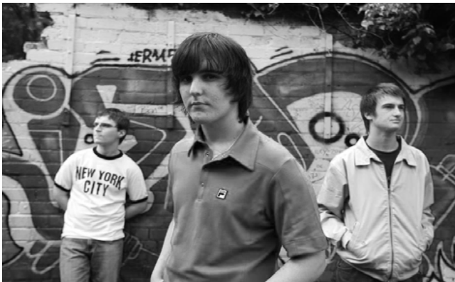
Censored – Nottingham rock/indie band headlining on Saturday night.