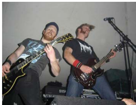
Bakewell's hard-hitting Skull Tanker

As usual, a burger stand and bar will be on site.