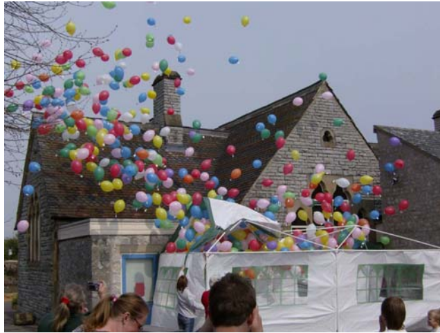
The balloons are released from Youlgrave School – but how far will they travel?

The blue bags in March raised £495, which is more per ton than last time. As we have already booked them to come again in September, please start saving your old clothes, bedding, shoes, etc.