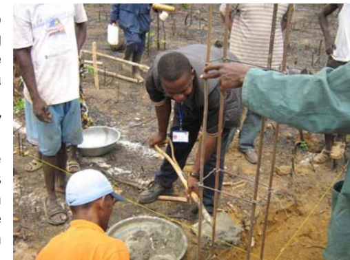
Sammy lays the foundation stone at the school.

The scheme aims to build the confidence of the people by helping them gain the skills they need to use in everyday situations. For example, Youlgrave has sent money to buy sewing machines and materials and paid for a tutor to teach a group of women tailoring skills. They have written letters to say how delighted they are and how empowered they feel to have a useful skill in life. We have also provided money for goats to begin a village goat herd. The literacy scheme therefore included education in animal keeping and encouragement to widen the local tradition of keeping goats for meat by introducing the notion of using goats for milk to enrich their diet.