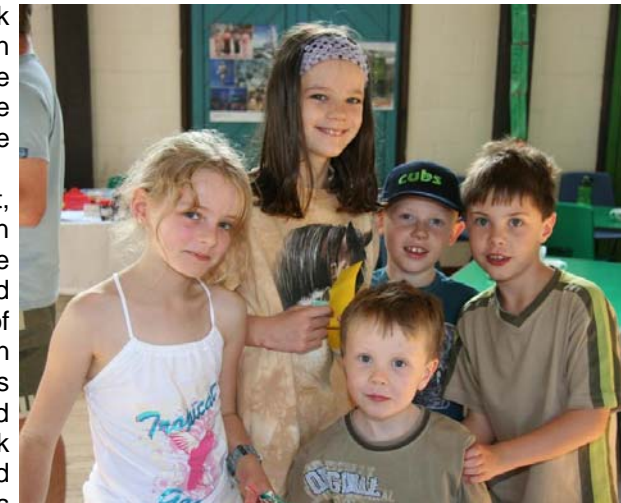
Above: some of the younger participants at the fundraising Funday last month.