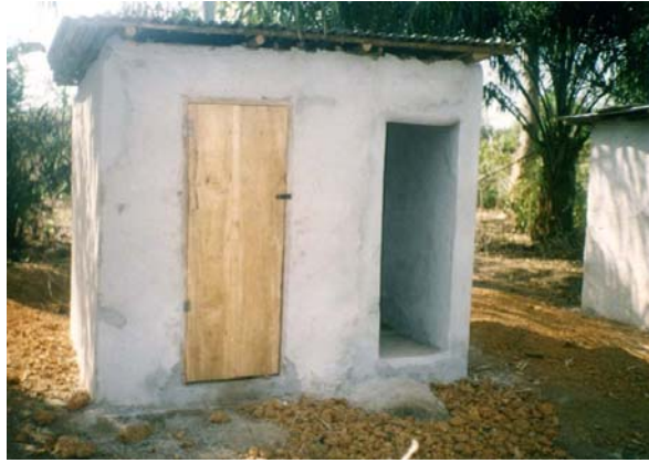
One of the 21 completed latrines that the people of Youlgrave have helped to build in Bangbutt.