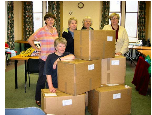
Five of the seven boxes of clothes ready to go, along with three boxes of toys, and four boxes of jeans from Fillbar.

the red Bangbutt collection boxes scattered throughout the village. Please give us your spare change as you buy a lamb chop, petrol or a pint of beer – it all mounts up and will help pay the £200+ shipping costs of the 14 boxes we began with. Again, thank you in advance.