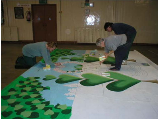
Designing the scenery for last year's Youlgrave Panto.

produce, the five painters on their hands and knees for 6-7 hours each day!