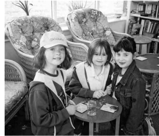
Youlgrave Brownies helping out Abbeyfield