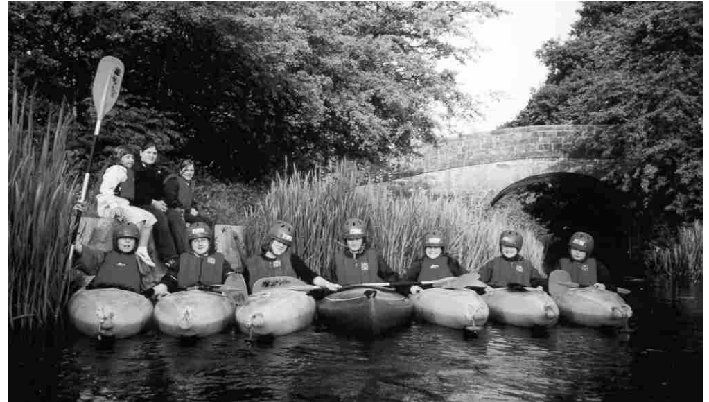
1st Youlgrave Guides afloat (just) on the Cromford Canal during the summer

Guides in the village made the most of this year's wonderful summer. We have had a varied and challenging programme - from canoeing on the Cromford Canal to scrub-clearance at the new Bankside wildlife garden, through to cooking on open fires one evening at the Old Hall Croft (thanks to the Toynes).