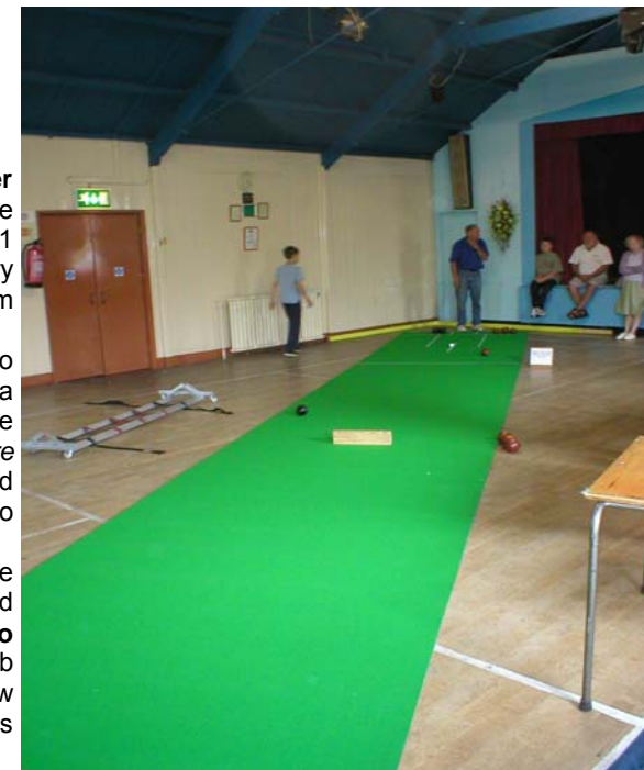
The new indoor bowls mat is proving a great success. Come along and take part Tuesday afternoons from 2pm.