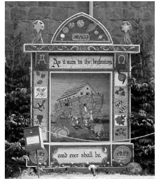
The Church Well, 2002

The Bugle is taking its customary holiday over August, and will be back refreshed and