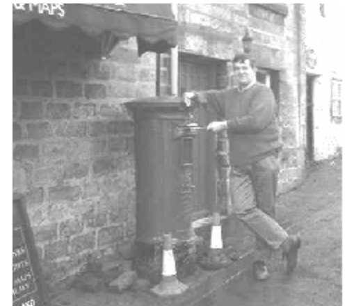
Getting to grips with Youlgrave's new pillar box

Don't forget to keep sending in any news or items concerning Alport, Middleton and Youlgrave, plus details of forthcoming events. It's also that time of year when annual sponsorship of The Bugle is due, and for just £15 you can help