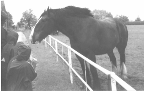
Major the Horse photographed at the Farm