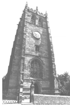
Youlgrave's impressive Church Tower