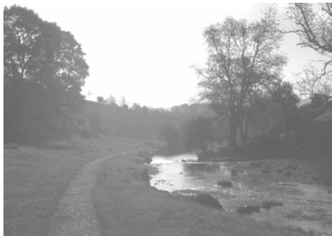
'Last of the Morning Mist, River Bradford' an example of the cards

On sale at Youlgrave Post Office and Rose's Newsagents, the cards are blank inside and suitable for any occasion. They cost 70 pence each or £3.50 for a pack of six.