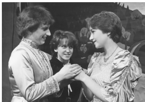
All the changes that the Chorus require are