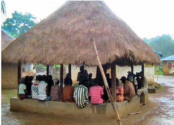
A 'Learning Circle' in Bangbutt.

We saw three such role plays: a fire arsonist at work; a family of a husband, two wives and two daughters, only one daughter being allowed to go to school; and finally a vivid drama of how the HIV/AIDS virus can attack people. At the end of the sessions, some of the participants stood up and told us how they had benefited from these sessions; how they now have confidence to stand up and speak for themselves; how they realize the benefits of working together in a group to sort out problems; how they can now