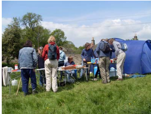
Guides at the Tent Café at Alport last month.

Iceland is a very expensive country, so we are therefore fundraising already to enable all the Unit old enough to be able to go. We have already raised over £1,500,