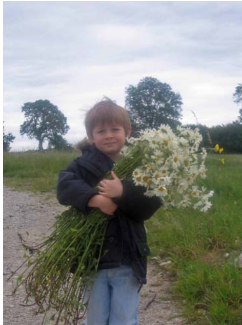
Gathering daisies for petalling.

There's a lot going on in our village in June, and some of us involved in welldressing can't believe that we're actually going to be contributing to the Carnival as well. I think those of us