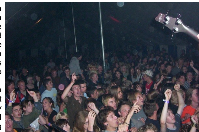
The crowd at this year's successful Music Fest.

Saturday opened with Matlock's Final Straw producing a performance which belied their young age, then the Scutty Neighbours high octane punk n' roll wound the whole night up and there it stayed!