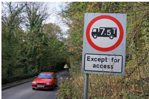
Weight restriction sign near Shining Bank.

Derbyshire County Council's Trading Standards, working with the Police, has left residents' monitoring forms at Youlgrave Post Office for local people to collect. Please take a free copy and fill it in with the details of any vehicles that pass through the village that you believe are infringing the weight limit. The Police will collect the completed forms from the Post Office each week (or you can simply post them back yourself) and these will be passed on to Trading Standards so that they can then trace the registered keepers.